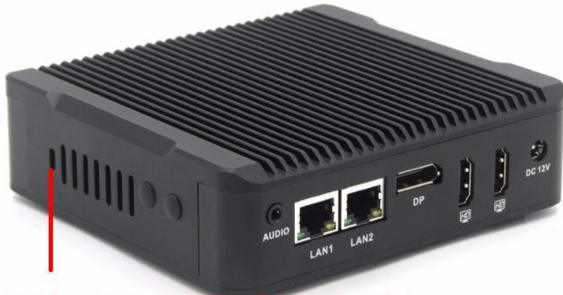
LAPTOP ANTI-THEFT LOCK HOLES *8