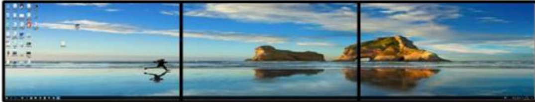
1X3 Model (resolution 5760x1080@30HZ)