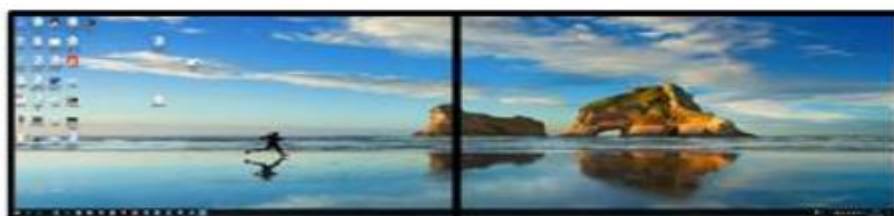
1x2 Model (resolution 3840x1080@60HZ)