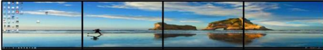
1x4 Model(resolution 5760x1080@30HZ)